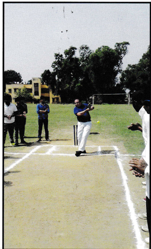
INTER COLLEGE CRICKET TOURNAMENT INAUGURATED by V.C, KNU