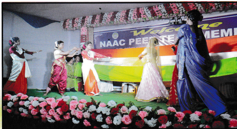
OUR CULTURAL PROGRAM