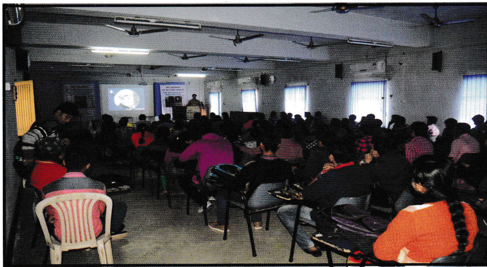
IQAC SPONSORED NATIONAL SEMINAR on MADAME CURIE