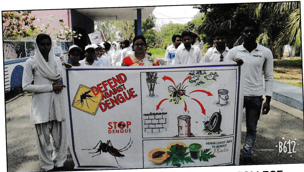
DENGU AWARENESS GOVT. PROGRAM by COLLEGE