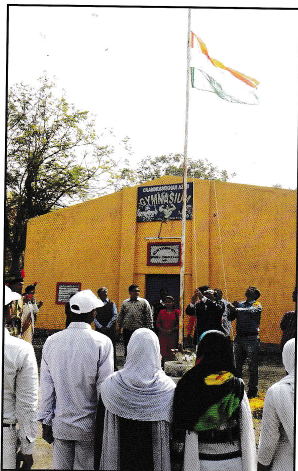
FLAG HOISTING ON 15TH AUGUST