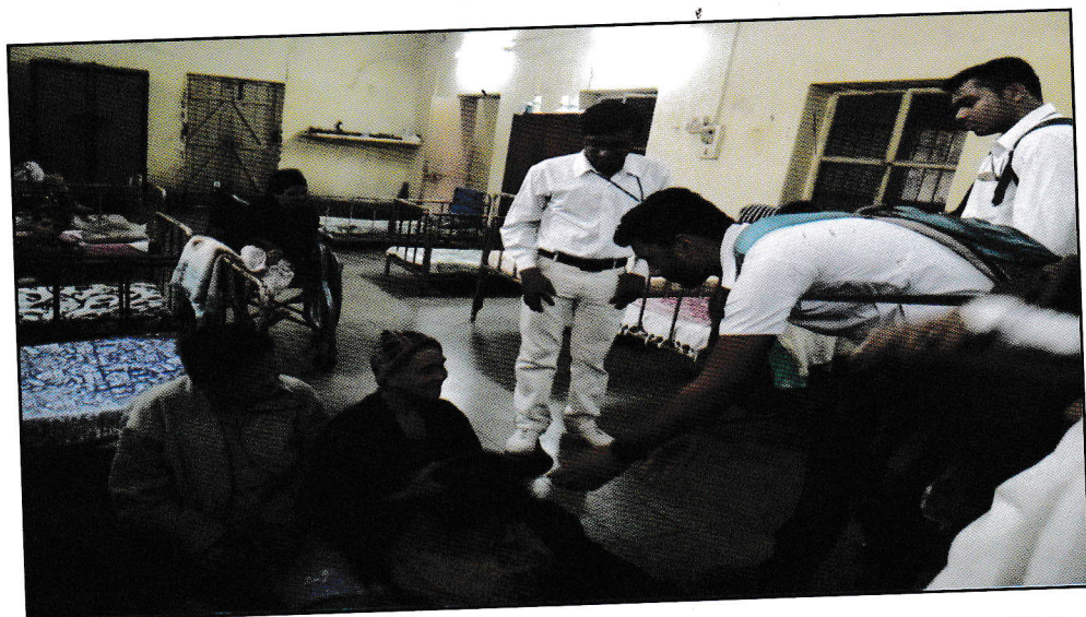
DISTRIBUTION OF BLANKET AT CHESHIRE'S HOME by NSS