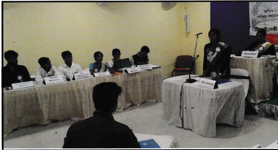
OUR STUDENT in YOUTH PARLIAMENT