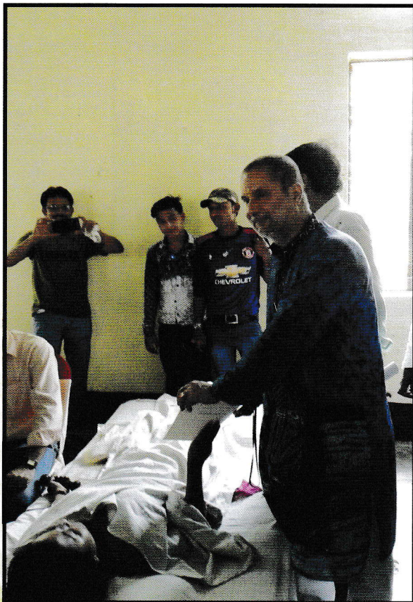
CERTIFICATE AWARDED TO THE BLOOD DONOR by HONOURABLE PRESIDENT