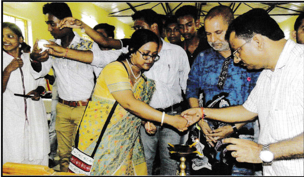
INAUGURATION OF BLOOD DONATION CAMP